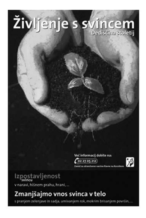
Figure 4. The campaign Living with Lead promotion material.