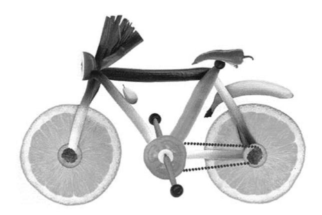
Figure 3. The campaign's Let's do something beneficial – let's eat fruit and vegetables 5-times a day and be physically active a half an hour a day brand - fruit/vegetable bicycle.