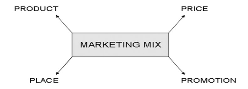
Figure 1. The 4Ps of »marketing mix« concept.

The main characteristics of this concept from the social marketing standpoint are: