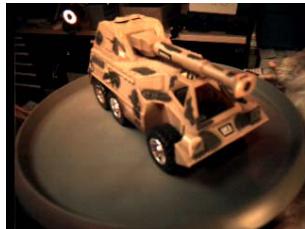
Fig. 2. One of 591 images of a toy artillery piece on a turntable. The average rotation between images is a little less than 1.5^\circ .

We applied the system to a sequence of 591 images of a toy artillery piece on a turntable; one of the images is shown in Figure 2. The system selected approximately 10 attention windows per image, converted the attention windows to parametric feature vectors and then clustered the resulting feature vectors into view categories. The average image windows for the eight most commonly occurring view categories are shown in Figure 3.